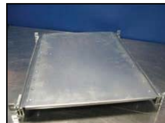
Instrument Rack Shelving (Fixed or Sliding)