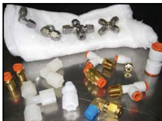
Stainless Steel, Brass & Kynar Fittings