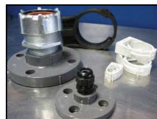
Clips, Clamps, Compression Fittings & Flanges