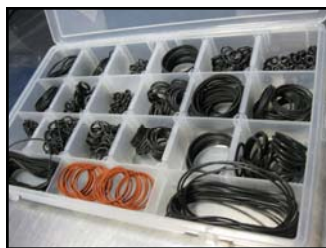
O-Rings for Gas Analyzers

American Ecotech offers various accessories to enhance your Air Monitoring System, including cable management trays, instrument racks, meteorological sensor brackets and cross arms, vacuum pumps and exhaust manifolds.